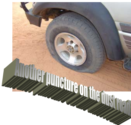
Another puncture on the dust road