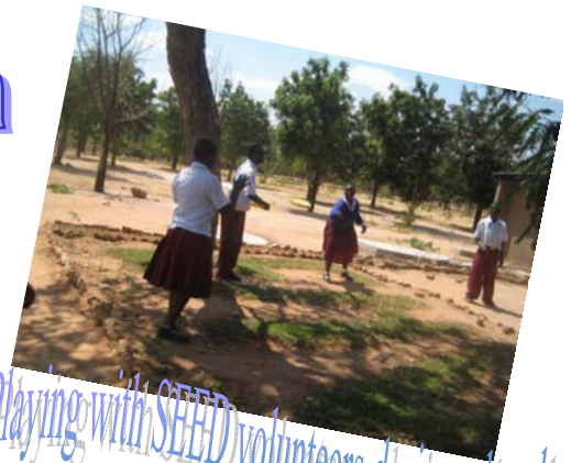
Playing with SEED volunteers during a break.