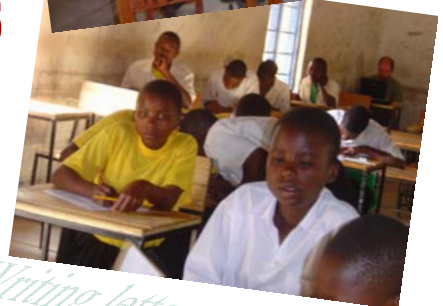
Writing letters to supporters